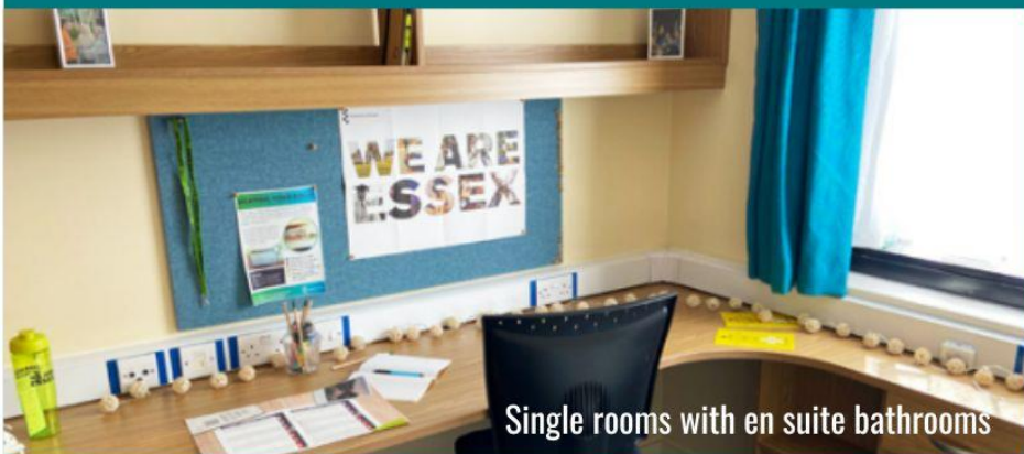
Single rooms with en suite bathrooms