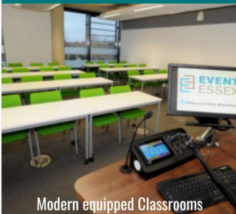
Modern equipped Classrooms