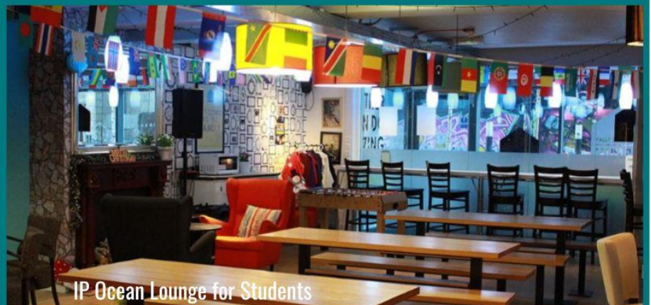
IP Ocean Lounge for Students