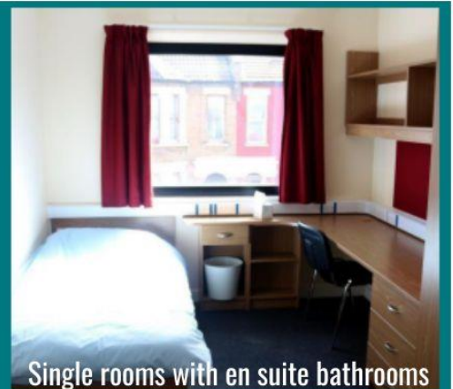
Single rooms with en suite bathrooms