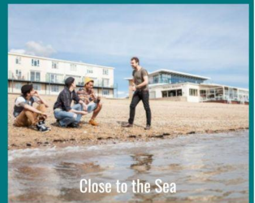
Close to the Sea